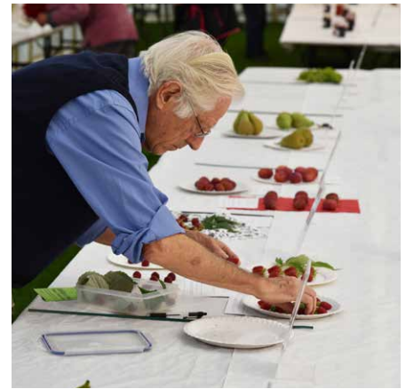
Getting it just right