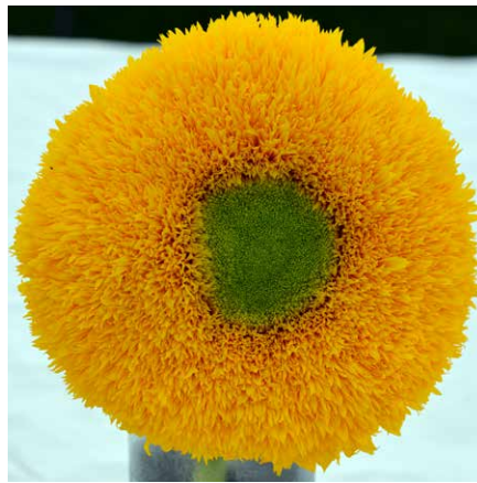
Sunflower - Wow!

All KHS 2017 Show Pictures © Brian Secrett