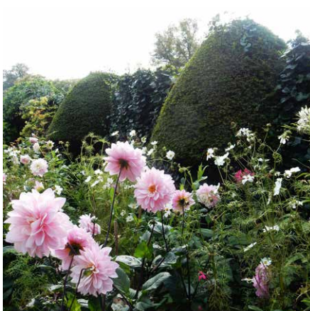
Dahlias & Cosmos at Chenies Manor