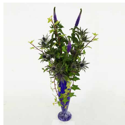
Floral Art Entry - “Mood Indigo”