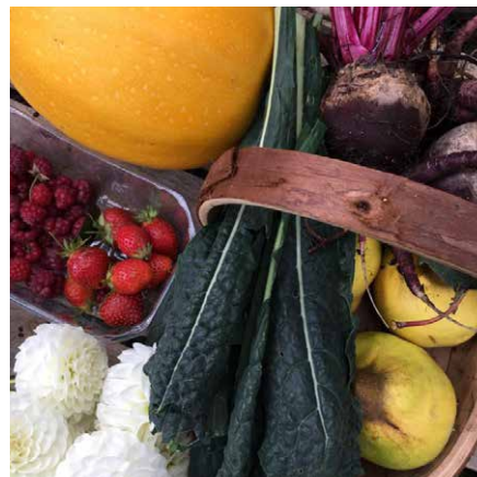
Facebook Post - Allotment Harvest! With thanks to Jenny Fenhalls