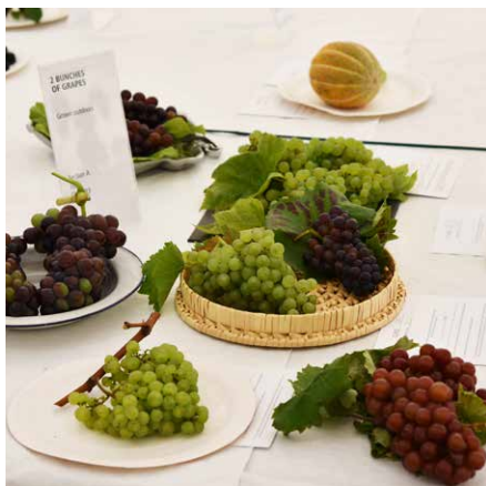
2 Bunches of Grapes