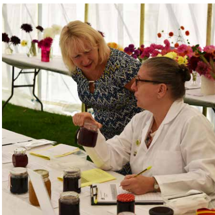
Judging Jams & Preserves at the KHS Show