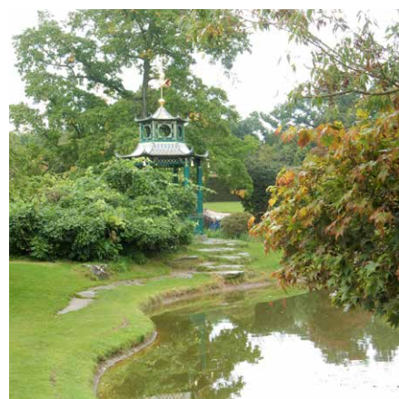
Cliveden Water Garden