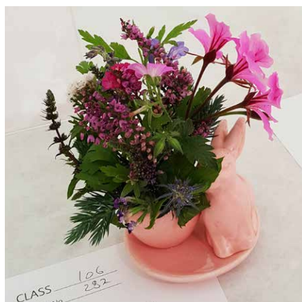
Floral Art Entry - “Eggstra Small”

The message is: all amateurs have to start somewhere, so be bold, and enter the show. I came home with the Kew Floral Cup, and I still cannot believe it.