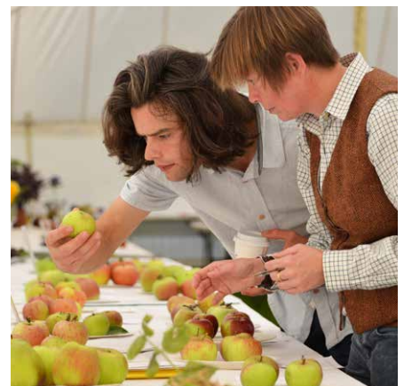
Judging Fruit & Veg