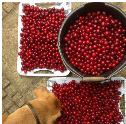
Instagram Post - Stanley & The Cherry Harvest

You may recall that KHS has developed a Facebook and Instagram presence, and we are gradually building up our followers. There are currently 217 followers on Instagram, and the KHS Show Poster reached 100 people on Facebook. Plans are underway that will allow all members that so wish to post their own entries and photographs on both sites, so watch out for news on this. Here are links to the KHS accounts: f KHS Facebook KHS Instagram