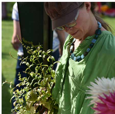
Looking for a Bargain