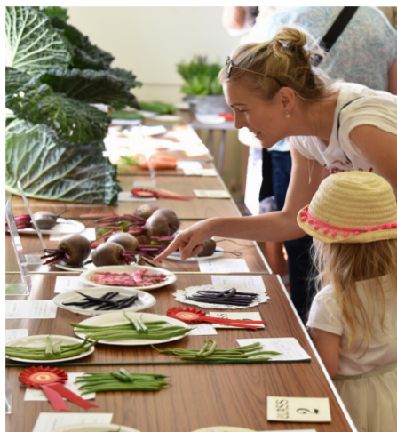
Inspecting the results