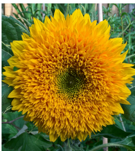
Sunflower - Teddy Bear