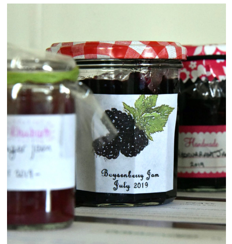
Jams and chutneys were popular!