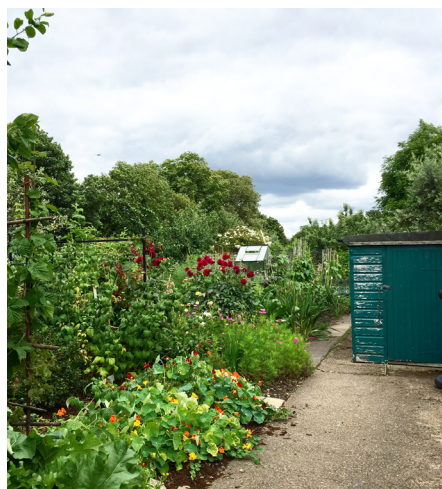
Short Lots - Early Summer