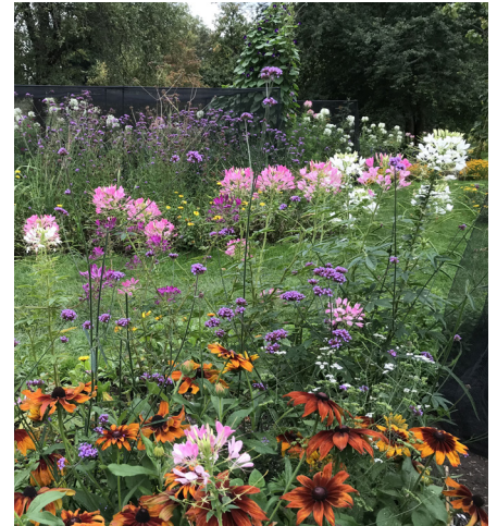
Colourful borders

The project to restore the house and the remaining 13 acre garden is a huge on-going task. The history of Fulham Palace, the Summer home of the Bishops of London until 1973, spans 1,300 years, and has seen many changes in both architectural and horticultural fashion, still evident at Fulham. The garden was an important source of food as well as a place for leisure away from the pressures of London, and for those Bishops with an interest in botany and horticulture of which there were several, a place of study and learning. Fulham Palace is free to visit and explore, and you can even buy a variety of fresh produce from the garden as available. A highly recommended visit to a fascinating and tranquil refuge, close to home. - LK