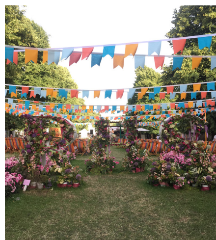
RHS display - Hampton Court Flower Show