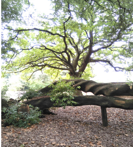
Ancient Holm Oak - planted in the 16th C.

Where can you find a Bishops' tree complete with several Bishops, including a somewhat peculiar, spectacle-wearing Bishop apparently wielding a bottle, a pink Gothic gatehouse folly with oversize chimneys, a partly excavated moat, an Indian Bean, Cork, Holm, Scarlet, Cypress and Fulham oaks, both Black and White Mulberries, Black Walnuts, a Cider Gum, a Swamp and a Japanese Cypress, a Giant Sequoia and English Elms among many others, a black cat in a box (sometimes), a knot garden, a walled garden, an apple arbour, peace, calm, food and drink, Roman beginnings and a rich red Tudor brick courtyard with scorched black brick diaper patterns that inspired similar decorations at Hampton Court? All this and more was shown and explained to us by our guide, on the KHS visit to Fulham Palace Botanical Garden on Monday 16th September.