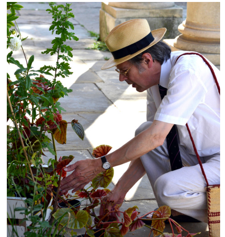
Tending to the Plant Stall

Some cookery classes, for a jam, a Victoria Sponge and a chutney were included this year which were well supported and all looked wonderful. We had 258 adult visitors during the afternoon, who enjoyed the friendly atmosphere and were able to relax with tea and cake outside the hall after viewing the Show. The plant stall was also very popular.