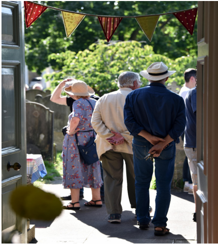
Enjoying the glorious weather