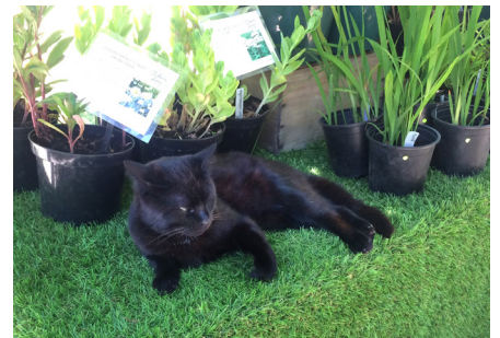
Edmund the Palace Cat

The project to restore the house and the remaining 13 acre garden is a huge on-going task. The history of Fulham Palace, the Summer home of the Bishops of London until 1973, spans 1,300 years, and has seen many changes in both architectural and horticultural fashion, still evident at Fulham. The garden was an important source of food as well as a place for leisure away from the pressures of London, and for those Bishops with an interest in botany and horticulture of which there were several, a place of study and learning. Fulham Palace is free to visit and explore, and you can even buy a variety of fresh produce from the garden as available. A highly recommended visit to a fascinating and tranquil refuge, close to home. - LK