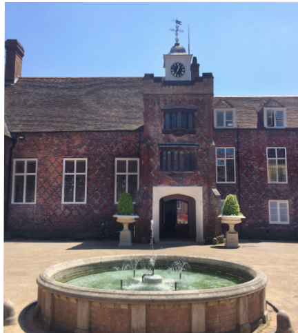
Fulham Palace Courtyard