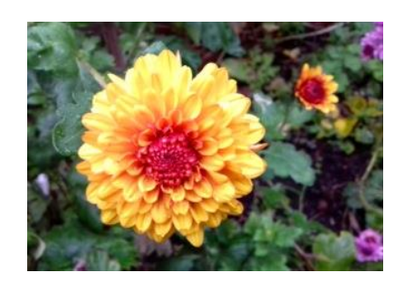
Chrysanthemums grown by members