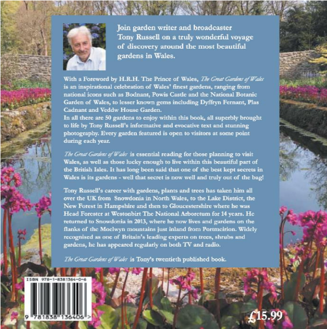
RRP £15.99 To purchase copies, personally signed by the author, visit www.gardenstovisit.net