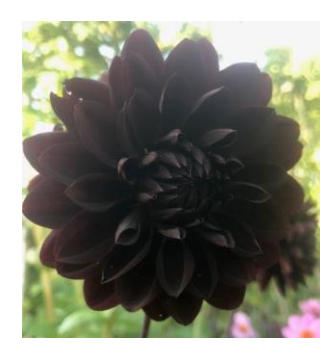
Dahlias growing at Short Lots allotments

It is still only £5 per member or £10 per couple, (please see the end of the newsletter for a subscription form including a standard order mandate).