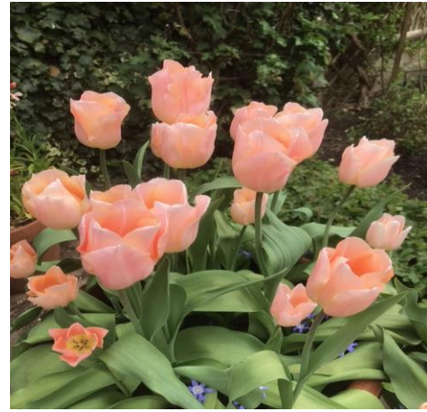
Tulips 'Apricot Beauty'