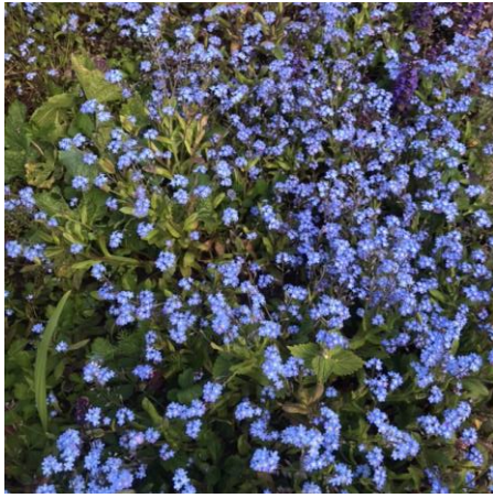
Forget-me-nots at Short Lots