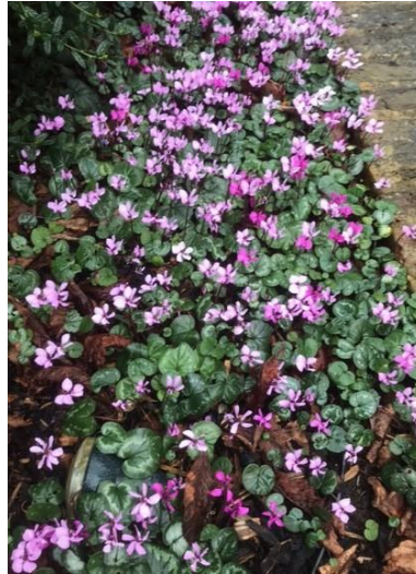
A carpet of cyclamen